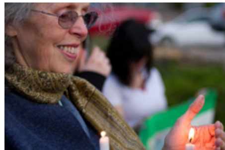
Ina May at the International Day of the Midwife march in Seattle

Ina May Gaskin celebrated the recent publication of Birth Matters: A Midwife's Manifesta on July 25th with an interview on the Diana Rehm Show on National Public Radio. You can listen to the interview here .